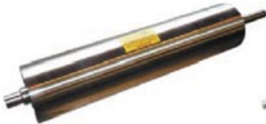
Ferrite head roller for a MRF plant. Face width 1555 x 218mm dia. Crowned face. Shafts machined to order