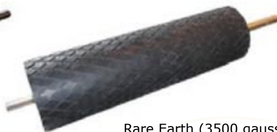
Rare Earth (3500 gauss) rubber lagged magnetic head roller for tyre recycling facility.